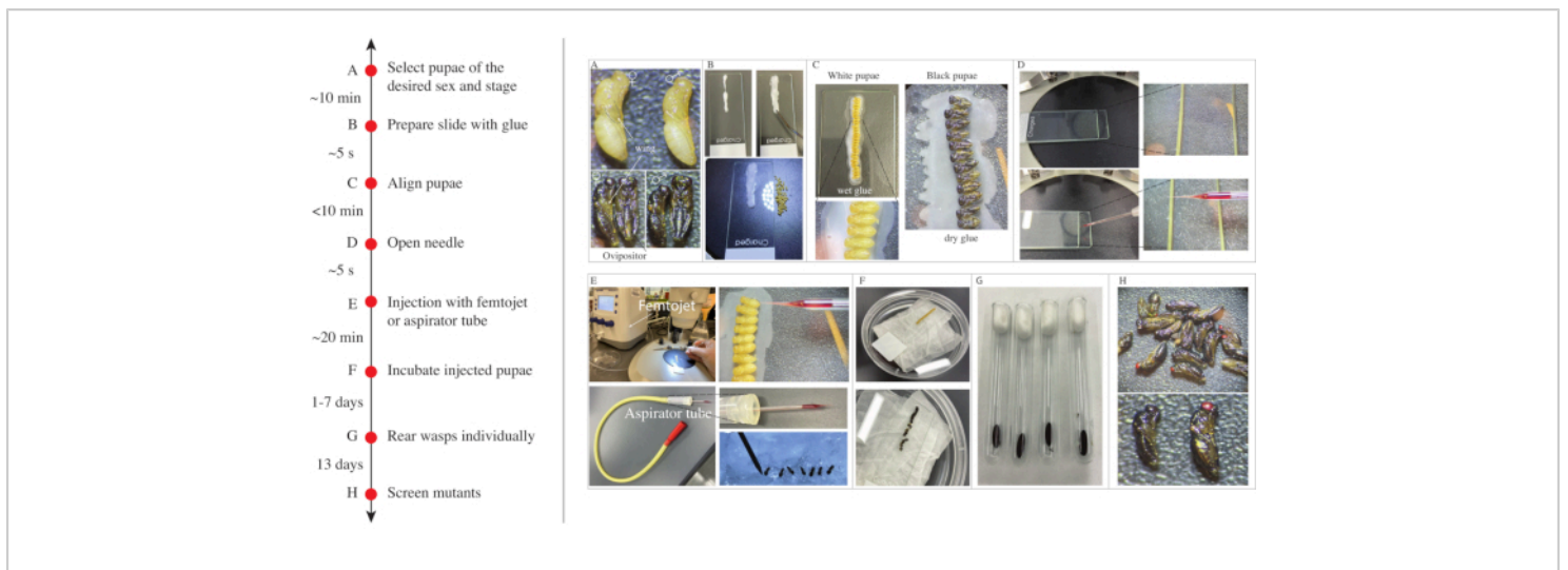
Figure 1: Timeline for pupal and adult Nasonia vitripennis microinjection. (A) Male and female white (top) and black (bottom) pupae are collected, (B-C) aligned and glued to a glass slide for injection. (D) Capillary needle is prepared and opened, sliding it on two overlapping slides. (E) Needle is attached either to the Femtojet (top) or to an aspirator tube (bottom) for injections.(F) The injected pupae on the slide are transferred to a Petri dish with a wet tissue on the bottom to keep humidity. Upon emergence, (G) females are placed singularly in small glass tubes and allowed to oviposit on Sarcophaga pupa. (H) Screening of the offspring to detect mutants. Please click here to view a larger version of this figure.